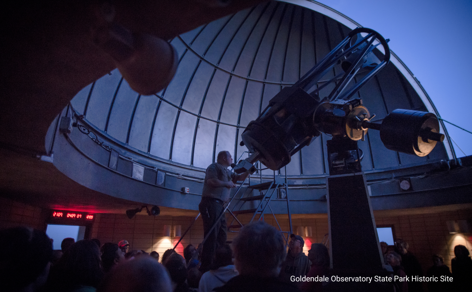
Goldendale Observatory State Park Historic Site