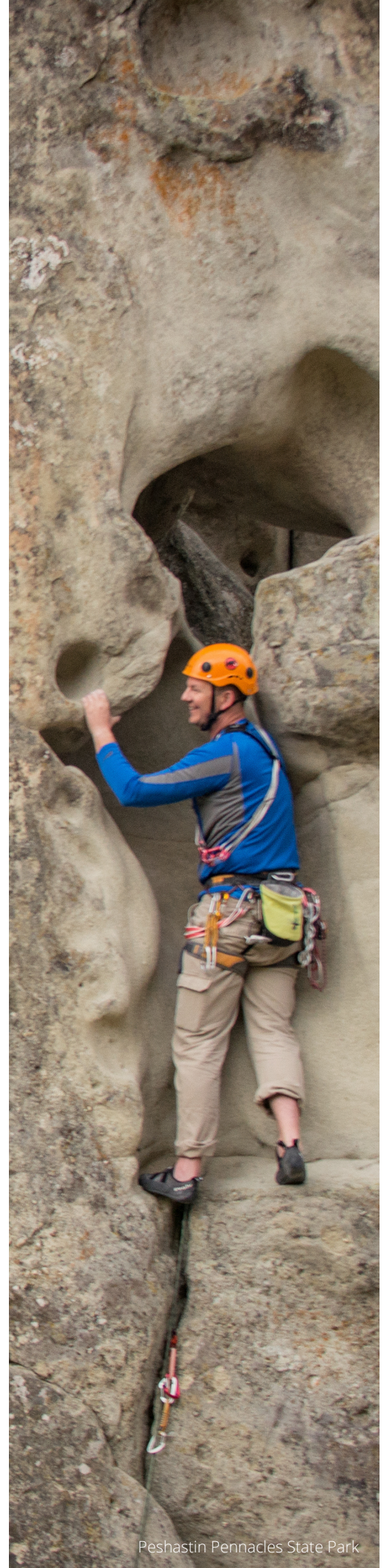
Peshastin Pennacles State Park

Washington's state parks will be cherished destinations with natural, cultural, recreational, artistic, and interpretive experiences that all Washingtonians enjoy, appreciate, and proudly support.