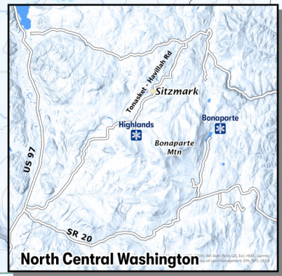
North Central Washington

To Sitzmark, about 1 mile north of Havillah