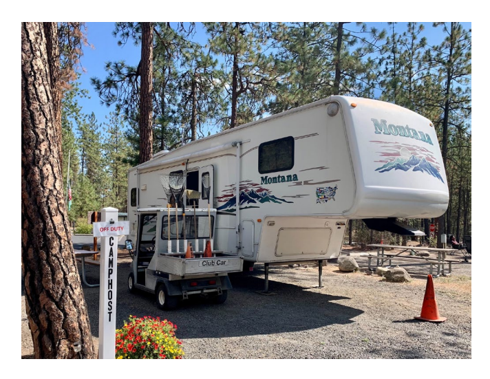
HOST DUTIES: Cleaning campsites, assisting with general park cleanup, assist visitors/campers, working at contact station for check-in/out duties.