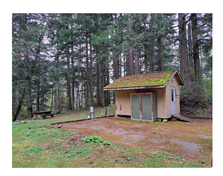
HOST DUTIES: assist with check in/out, help with inventory, and general clean up.