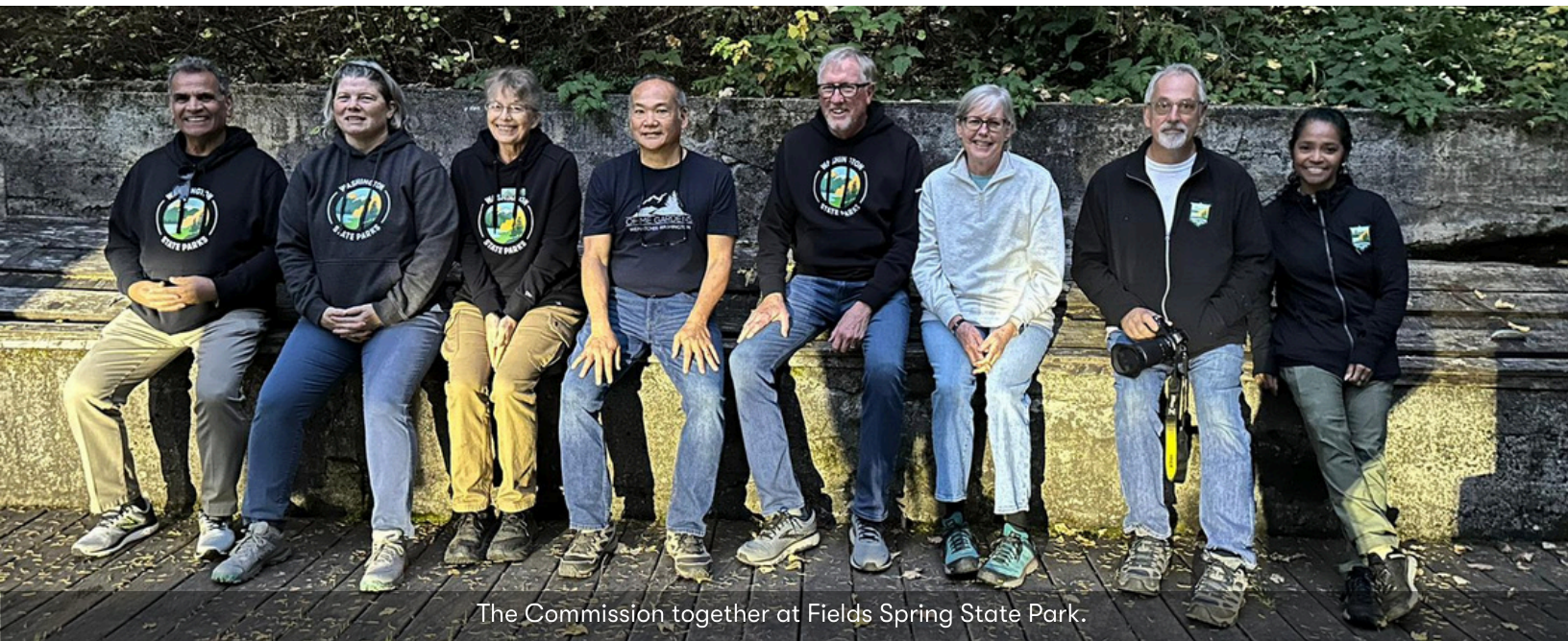
The Commission together at Fields Spring State Park.