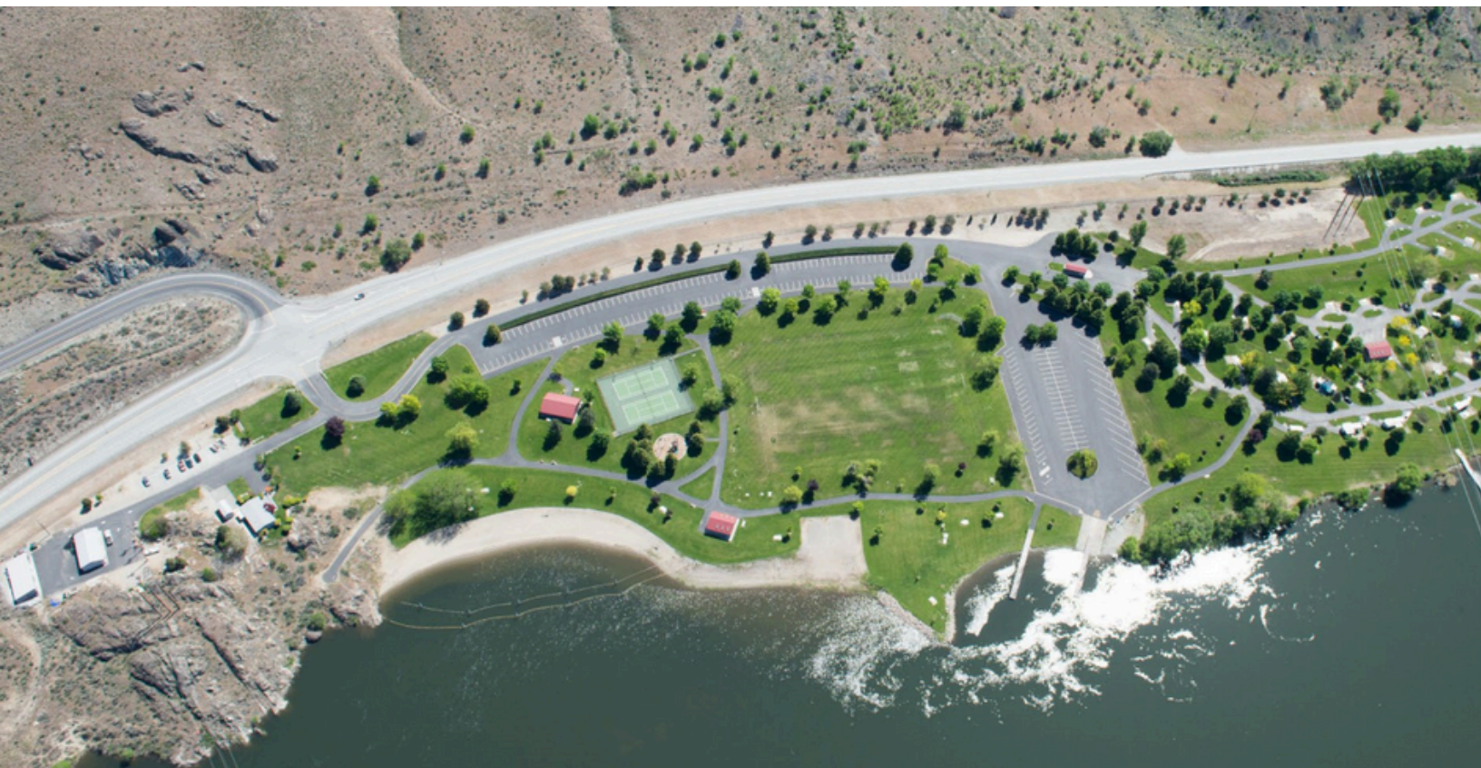
Beebe Bridge Park in Chelan County