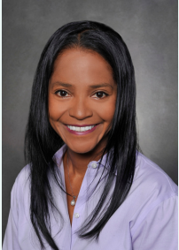
SOPHIA DANENBERG CHAIR