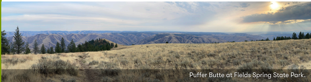
Puffer Butte at Fields Spring State Park.