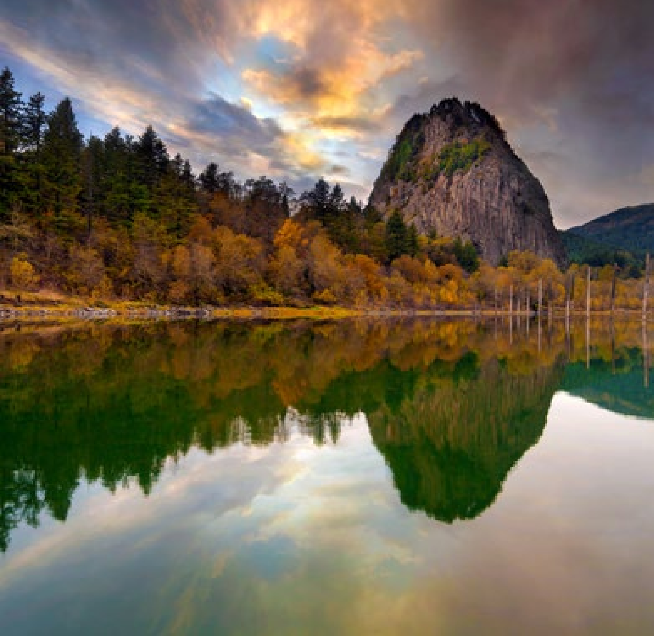
Beacon Rock State Park