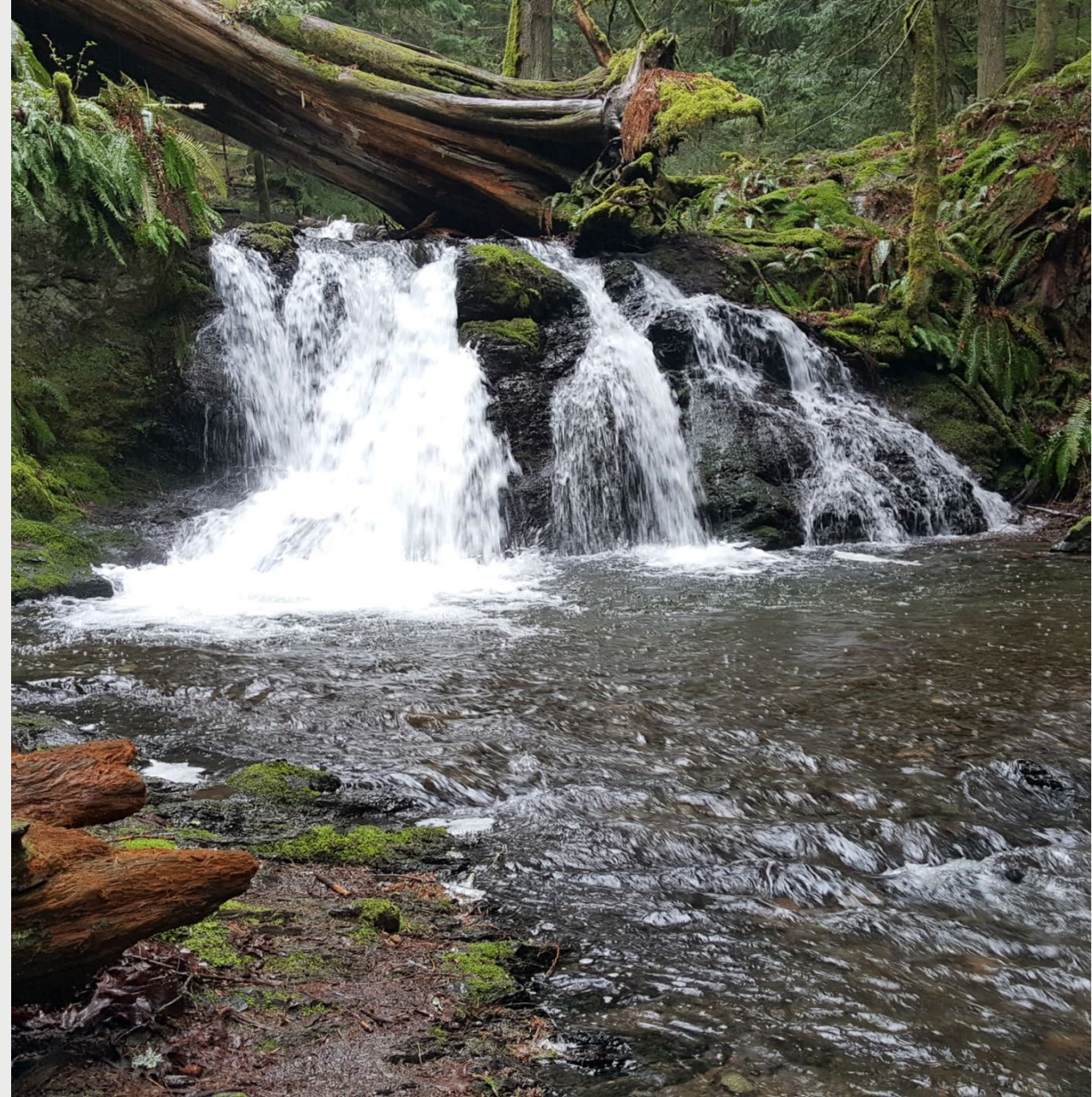
Moran State Park