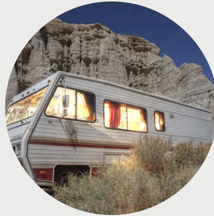
Partial Hookup Sites

Have nearby drinking water, sink waste, garbage disposal and flush restrooms