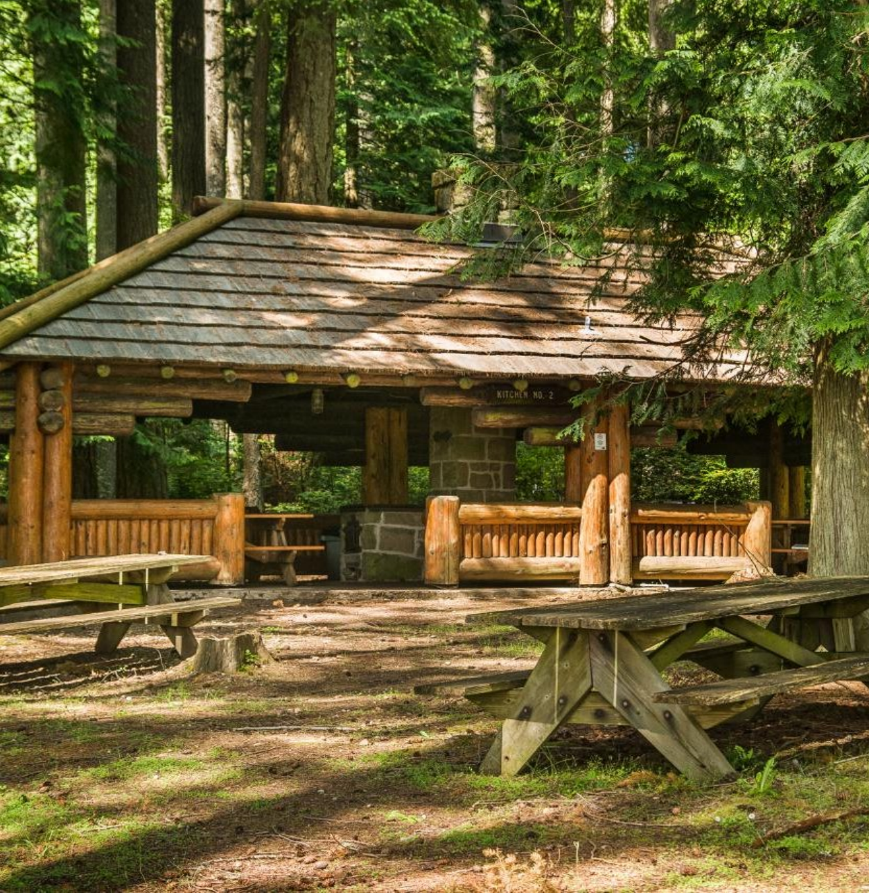
Millersylvania State Park