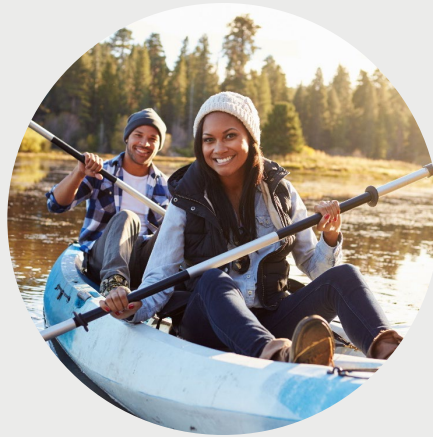
Water Trail Sites

Open to campers who arrive by foot or bicycle.