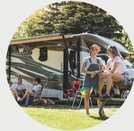
Full Utility Sites

Have electrical hookup. Many have water hookup